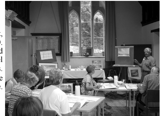
Participants enjoying the recent Art Workshop